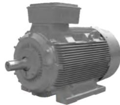
Ordinary asynchronous motor