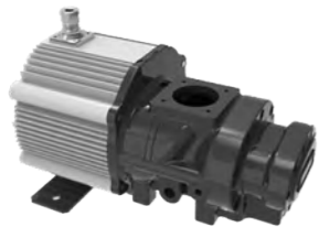
Permanent magnet motor